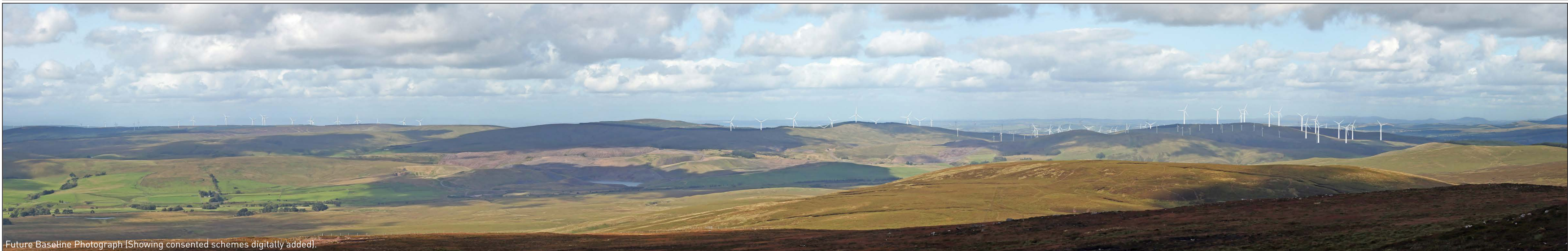
Future Baseline Photograph (Showing consented schemes digitally added).