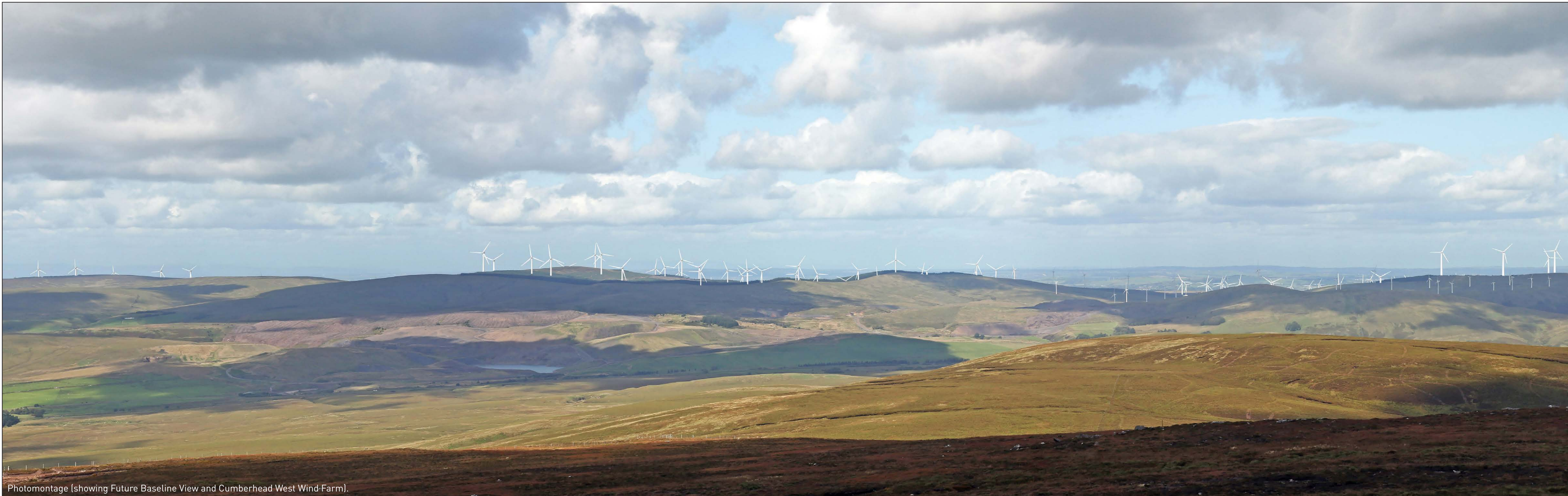
Photomontage (showing Future Baseline View and Cumberhead West Wind Farm).