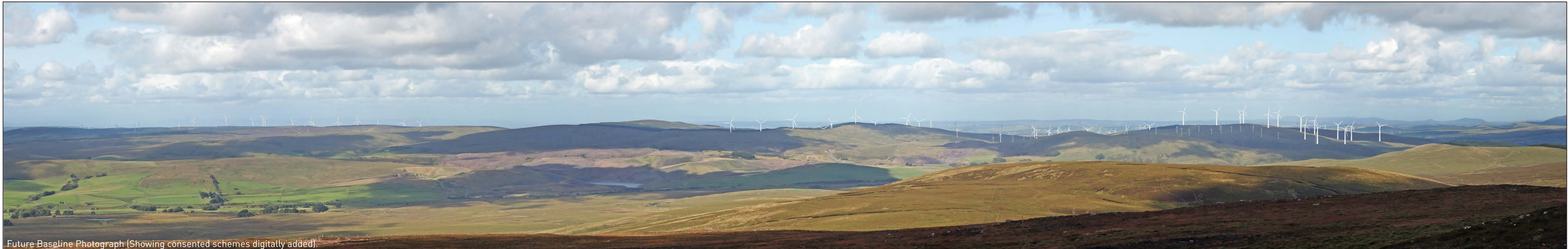
Future Baseline Photograph (Showing consented schemes digitally added).